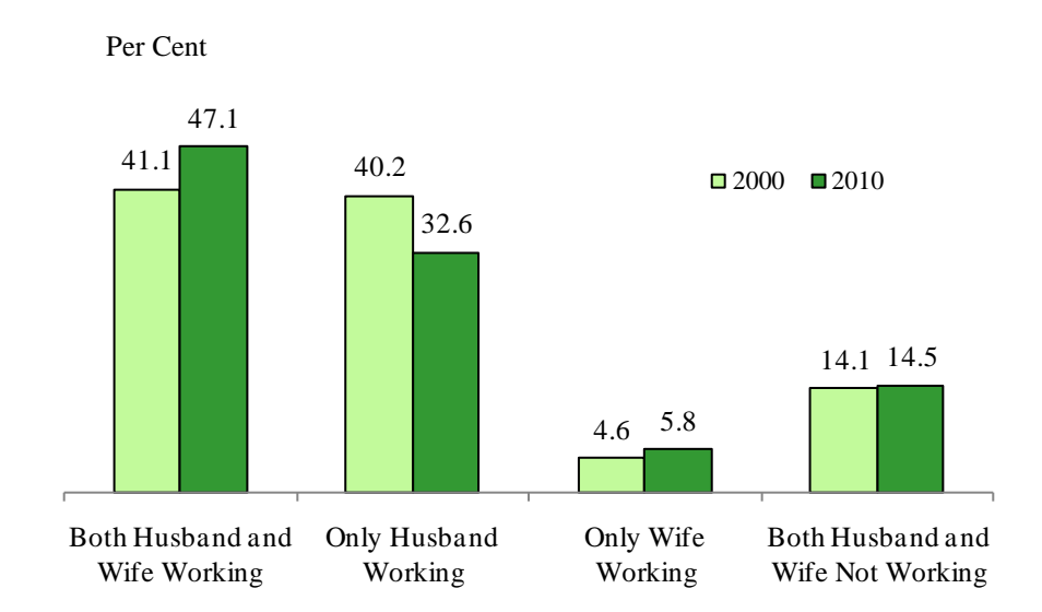
Chart 1 Married Couples in Resident Households by Working Status of Couple

The number of married couples increased from 728,200 in 2000 to 880,800 in 2010. The traditional arrangement where only the husband worked was less prevalent, with the proportion declining from 40 per cent in 2000 to 33 per cent in 2010 (Chart 1). The proportion of married couples where both husband and wife worked accounted for 47 per cent in 2010, up from 41 per cent in 2000.