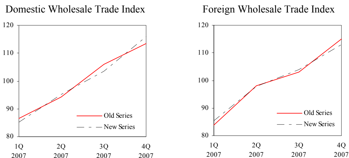
Chart 2: Wholesale Trade Index at Current Prices (2007=100)

23. Chart 2 shows the comparison of overall Domestic Wholesale Trade Index and overall Foreign Wholesale Trade Index at current prices of the 2000-based and 2007-based series during 1Q2007 to 4Q2007. The old and new series present comparable trends of strong growths in both domestic wholesale sales and foreign wholesale sales throughout 2007.