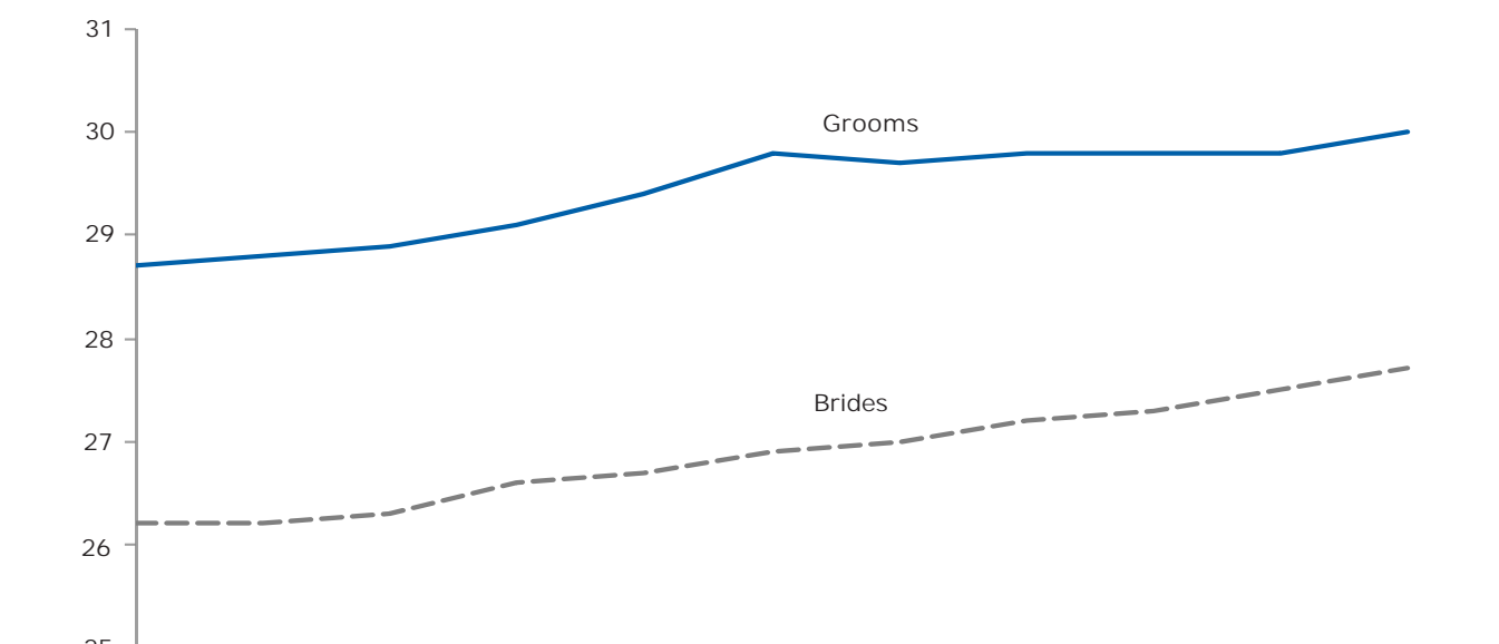
CHART 1 MEDIAN AGE AT FIRST MARRIAGE IN SINGAPORE, 2000 – 2010

For more information, download a softcopy of the report on "Statistics on Marriages and Divorces 2010" from SingStat website at: